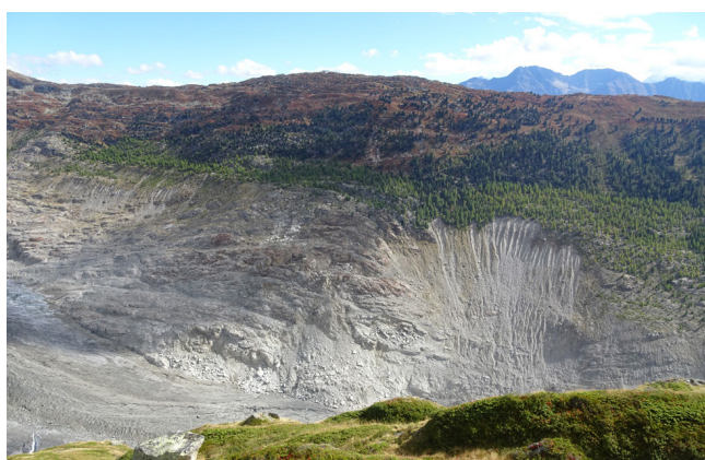
Figure 2: The Moosfluh landslide area: The foot of the slope is destabilized by the retreat of the Aletsch Glacier and the lack of glacier ice.

images are then uploaded to the servers, where a complex algorithm selects the best photos and then calculates the deformation. For this purpose, the displacement of the smallest image fields over a desired period of time is calculated. Also, we apply a proprietary algorithm to select the optimum imagery considering the frequently changing visibility conditions and light/shadow conditions. All deformation analyses and the high-resolution images of the DEFOX ® PRO webcam can be viewed at any time by authorized users via the Geoprevent online data portal on desktop, tablet or mobile (Figure 3). If required, an automatic alarm notification can also be integrated into the system. The service informs selected people immediately if a defined alarm value is exceeded. Every summer, the deformation camera shows an acceleration of the landslide, reaching its maximum in August. So far, no major event has occurred. Smaller discontinuities occur repeatedly and normally are shown in the deformation analysis days to weeks before (Figure 1). If a strongly increased activity of the landslide is detected, it is recommended to temporarily supplement the system with an interferometric georadar to obtain analyses in real time and under all weather and visibility conditions.