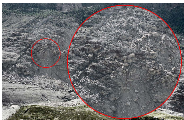
Figure 3: The high-resolution images of the DEFOX ® PRO webcam are available at any time in the online data portal for authorized users.