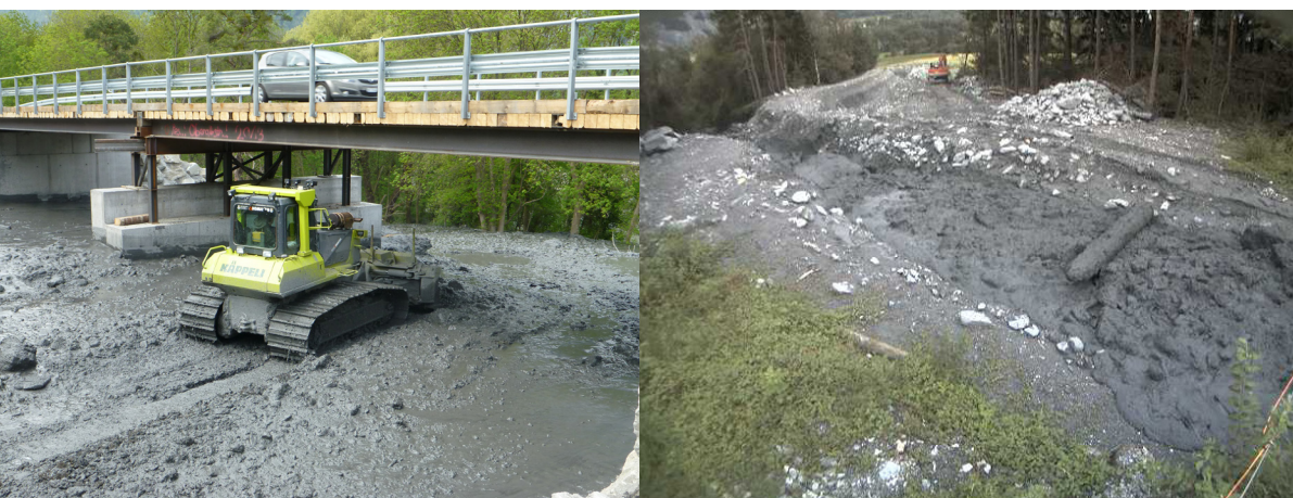
Title Page: View on the radars.

Figure 1: Left: The bridge of the cantonal road was destroyed by the debris flows. An emergency bridge was built as an immediate measure. Right: The debris flow carries earth and rock material, even entire tree trunks, down to the valley.