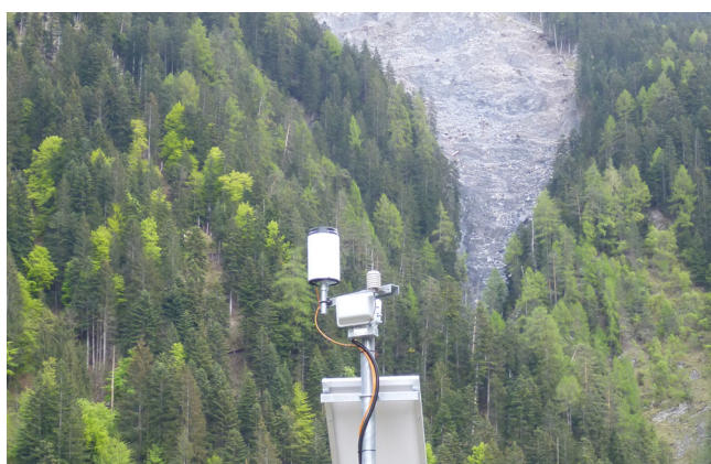
Figure 2: The installed weather station provides local data on precipitation and temperature. This data is important for debris flow forecasts.

still moving or unstable material, interferometric radar measurements were carried out in June. The analysis of the camera images as well as the radar data showed that the landslide flowed down the valley with velocities between a few cm and two metres per day. The bedload trap had been extended in case of emergency, because more material continued to accumulate. This material had to be continuously dredged, deposited or liquefied in order to be gradually discharged into the Rhine river. In order to make the work in the bedload trap and the flushing of the drainage channels as efficient as possible and to ensure the safety of the traffic and transport infrastructure, Geoprevent installed additional webcams and gauge radars in August 2013. The authorities were thus able to monitor the landslide, the emergency bridge, the bedload trap and the landslide area at several locations remotely in our online data portal. The online data portal is accessible via desktop, tablet or smartphone and offers an overview of all live and recorded data. In the event of critical level changes, warnings were automatically sent by SMS to enable immediate action to be taken.