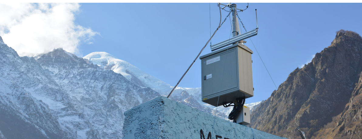
Title Page: The large debris deposits from the last debris flows are still visible near the road and the power plant.