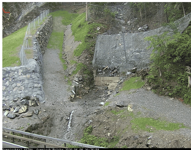
Figure 4: Rockfall dam with attenuator protection net.

Several cameras allow for remote site inspection via online data portal. Two PTZ cameras (pan-tilt-zoom) at Buggistäfeli and the road side can be remotely controlled at any time via PC, smart phone or tablet. In addition, the radar activates the cameras in case of an event for automatic image series of the rockfall or debris flow.