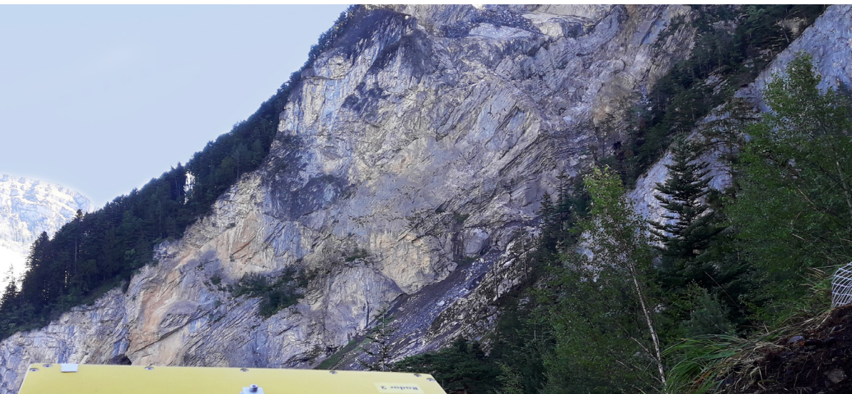
Figure 1: The interferometric georadar permanently scanned the site of the January 2019 rockfall event from the Plattwald site.