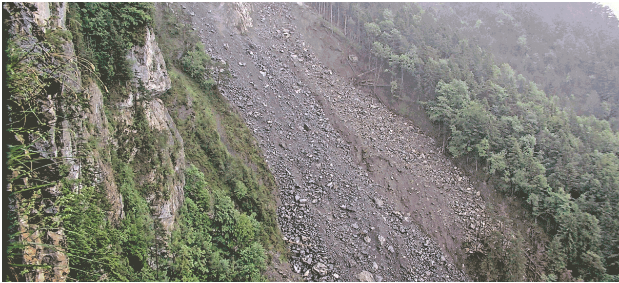
Figure 3: June 9, 2020: Heavy rainfall triggered several rockfall events in early June 2020. The upper radar detected this event at 8:26.10 PM and immediately triggered an alarm. 50 seconds later the combined motion sensors report an impact in the barrier above the road. Camera images clearly show the passage of two boulders (image below). The barriers the boulders cut through is designed as a "curtain" (attenuator) with the main purpose of event detection. The road is primarily protected by the dam and the alarm system.