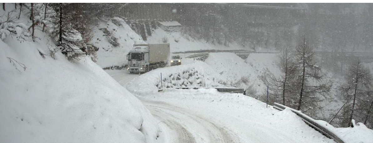
Title Page: Avalanche radar, Zermatt.