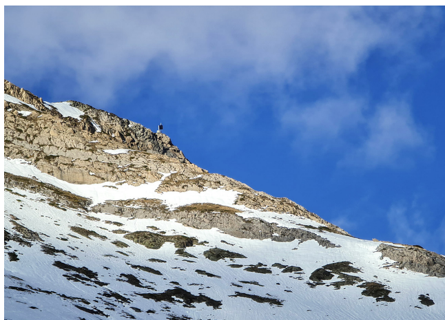
Figure 2: View from road D934 up to the avalanche radar system.

At four of eight avalanche paths on the last kilometers before the summit of the pass, galleries and protective forests preserve the road from avalanches and rock falls. The remaining avalanche paths regularly endanger the road and challenge the decisionmakers. An avalanche radar will help the team to assess the avalanche activity in the different avalanche paths and support avalanche control works. In fall 2020, a first O'BellX blasting system was installed in the Peyrelue couloir, L'Ourade Sud to trigger avalanches.