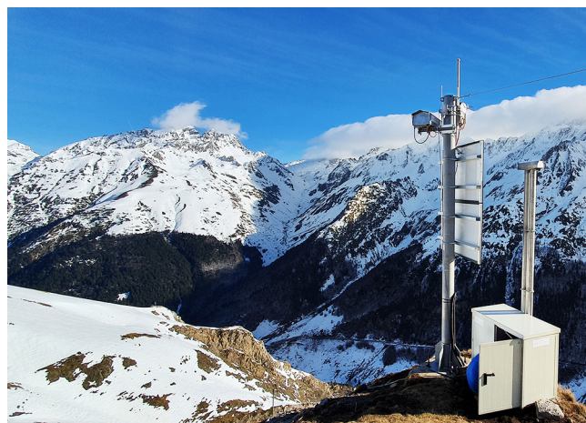
Figure 3: The avalanche radar enables wide-area coverage of the opposite avalanche slopes with a single device.

During the first winter, 8 spontaneous avalanches were detected. For the second winter, it is planned to connect several traffic lights to the detection system, which will automatically close the road in case of spontaneous avalanches.