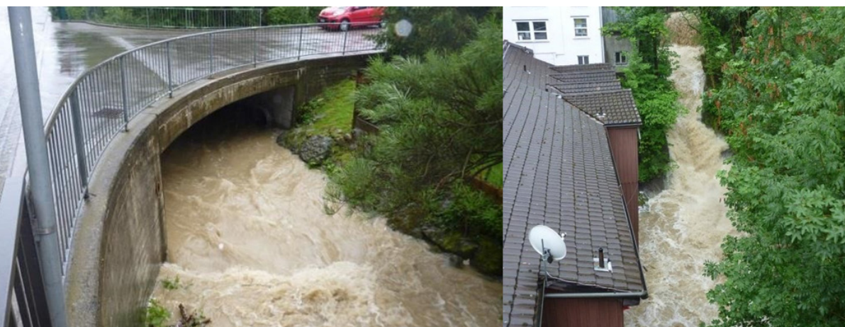
Title Page: Flood Steinach river in August 2015.