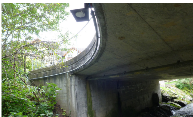
Figure 2: The gauge radar is mounted on the bridge, the pressure probe at the river bed.

The Flood alarm system Steinach has been running since 2014 and has triggered several alarms since then. The system serves not only as an alarm system but also for general monitoring of the creek and is now indispensable for disaster management of the area.