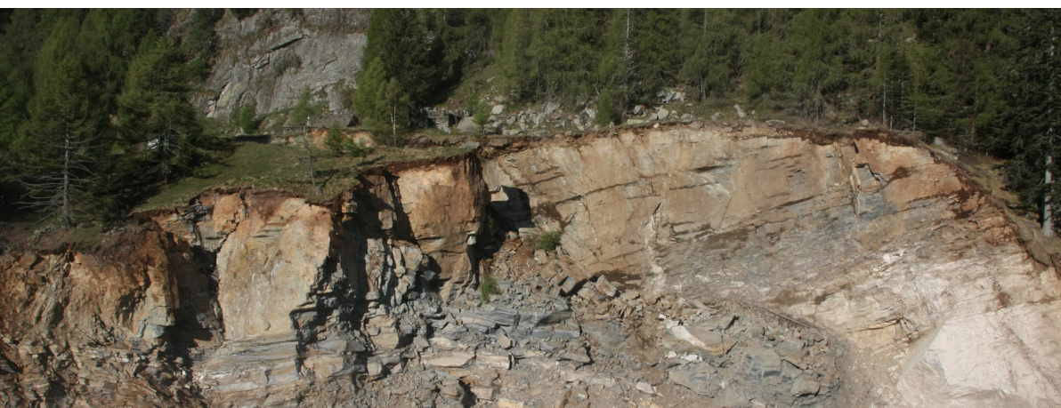
Title Page: Rock above Preonzo.